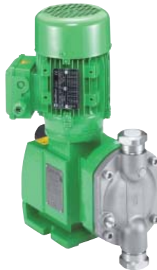
ProCam Smart DS 500