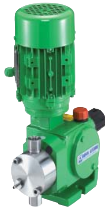
ProCam Smart DS 15