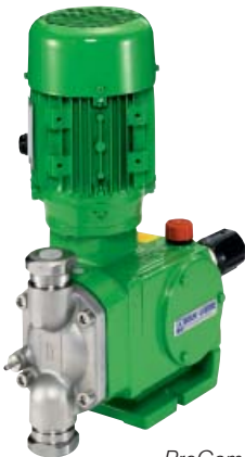
ProCam Smart DS 200