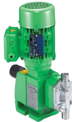
ProCam Smart DS 50