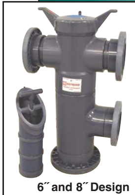
6" and 8" Design