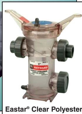
Eastar® Clear Polyester